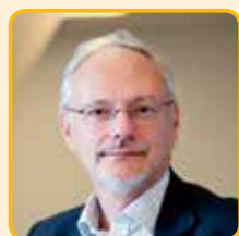
Mr. Jean-Michel Severino General Inspector of Finances French Ministry of Finances