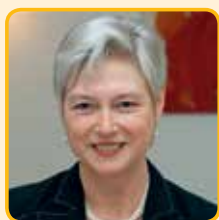
Ms. Maria van der Hoeven Executive Director International Energy Agency