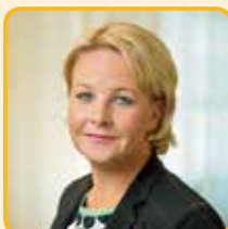
Ms. Hillevi Engström Minister for International Development Cooperation Ministry for Foreign Affairs