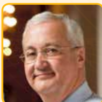
Mr. Sten Nordin Mayor of Stockholm