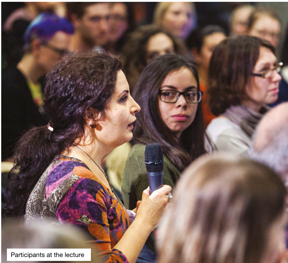
Participants at the lecture